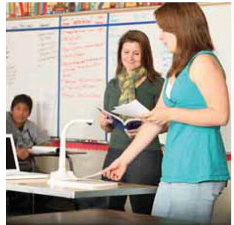
GradeCam camera kits are $98 each.

Do students need to use special pens to bubble? No. Students can use pen or pencil.